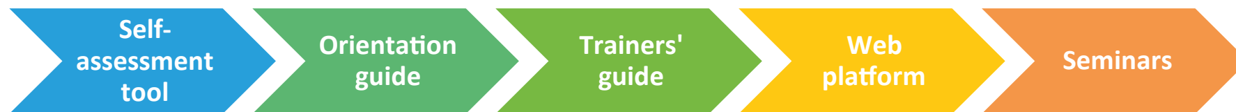
Chart 3. DESSA apprenticeship scheme supporting elements and tools.