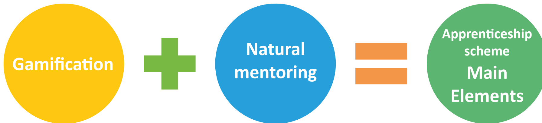
Chart 2. DESSA apprenticeship scheme main elements.